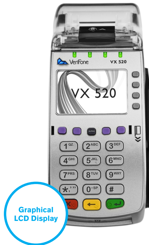
Graphical LCD Display